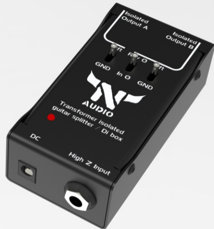
N-audio Isolated guitar splitter / DI box